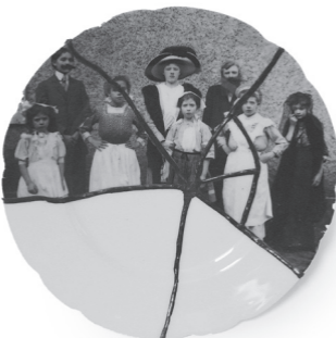
Anaïs Boudot, 6 Mascarade

Anaïs Boudot is a French artist and photographer whose work often centers on the materiality of photographic images and the appearance, disappearance and transformation of images. Much of her work investigates the different processes of image formation while exploring photography through analog and digital techniques, glass plate negatives, photograms, video and sculptural photographic objects. She creates image fragments of landscapes, interiors and bodies that hover between presence and absence. She invites viewers to hold onto the moments that become eroded over time while also repurposing photographic memories to show the reconstruction of what has been lost or forgotten.