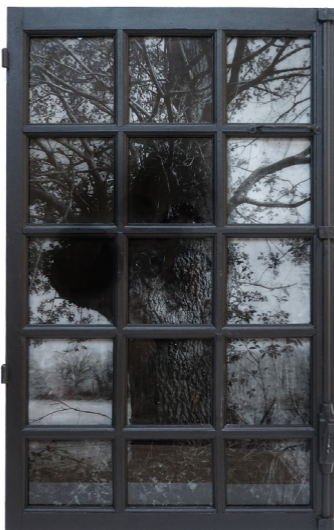
Anaïs Boudot, #03 Grand-Arbre Les ouvertures

A house serves as the center of life, family, intimacy and self-presentation, functioning as more than just a living space but also as a theoretical object and sociological indicator. Anaïs Boudot uses the house as a framework to explore how images hold, distort or even fail to hold memories. On view at Galerie Binome in Paris, from Feb. 2 to April 4, Boudot's collection, Nos reconstructions , highlights her multimedia techniques by using glass plate negatives, photograms and stained-glass to create three-dimensional, translucent structures. Boudot crafts the home as it captures memory, lineage and domestic intimacy, investigating the emotional architecture of domestic spaces and the instability of photographic memory.