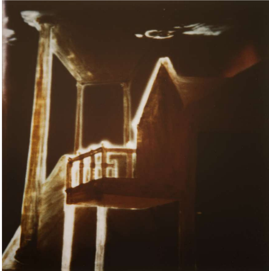
Corinne Mercadier, La maison et le temple, Polaroids-Photographies series, 1985-86 paintings on glass, polaroid SX70 rephotographed on Ekta 4/5 inch Cibachrome film framed with anti-reflective glass unique piece - circa 34 x 29 cm