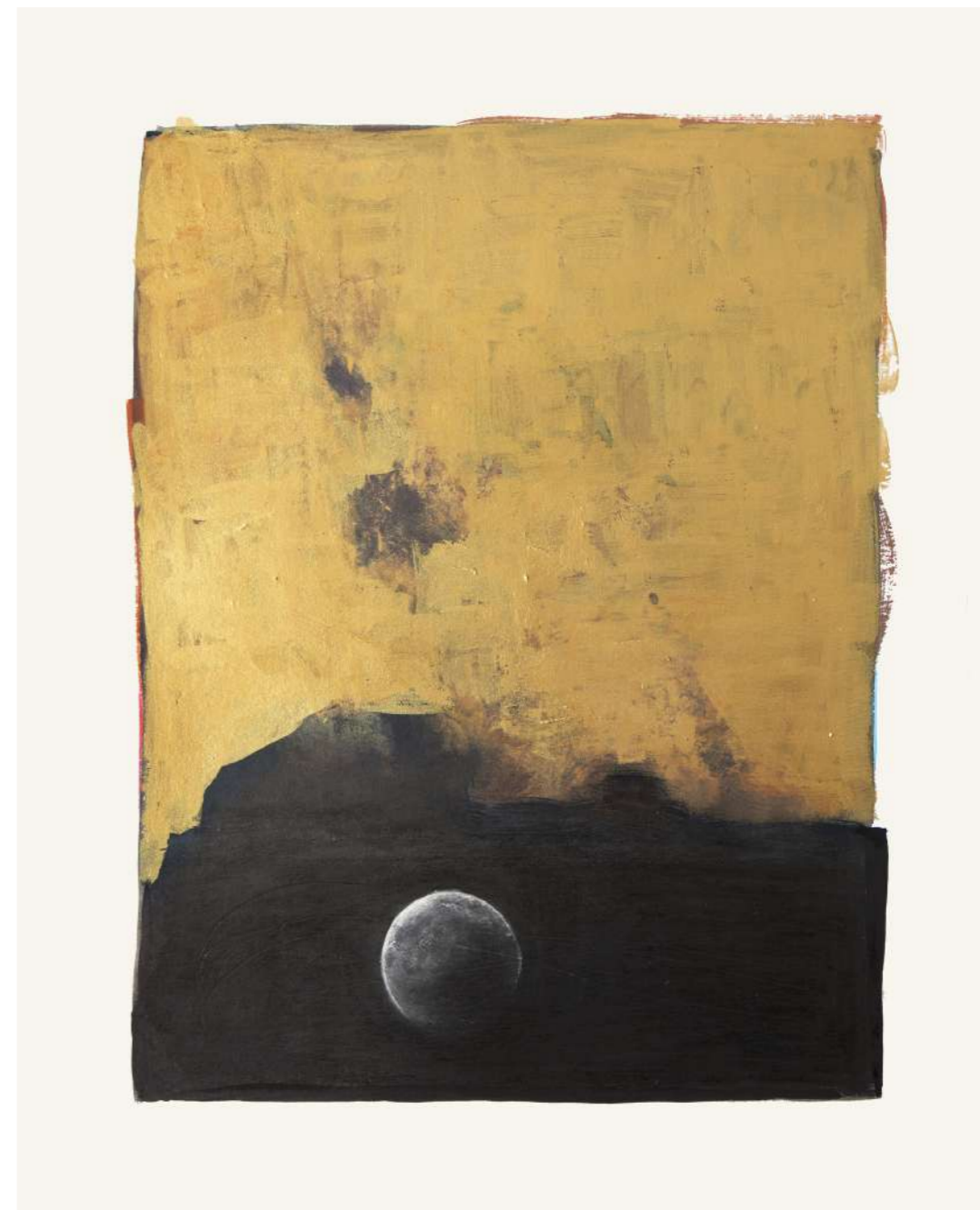
Corinne Mercadier, 30, Rêves series, 2023 ink, gouache, coloured pencil on Lavis Vinci paper frame and anti-reflective glass unique piece - 42.5 x 36 cm