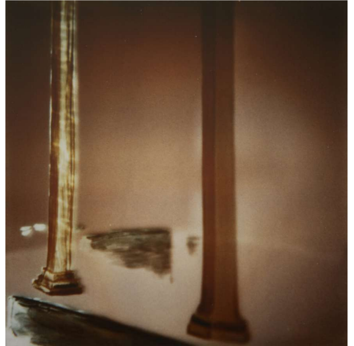
Corinne Mercadier, Deux colonnes, Polaroids-Photographies series, 1985-86 paintings on glass, polaroid SX70 rephotographed on Ekta 4/5 inch Cibachrome film framed with anti-reflective glass unique piece - circa 34 x 29 cm