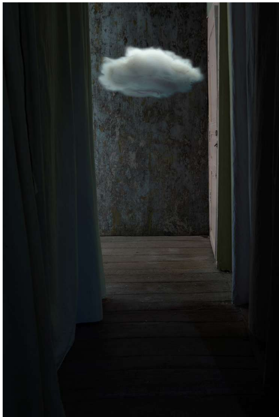
Corinne Mercadier, Laisser faire, La nuit magnétique series, 2022-24 painting on glass and photographs print on platinum fiber rag Canson paper black wood frame with anti-reflective glass edition of 5 (+2AP) – 90 x 60 cm

Corinne Mercadier's works are like breaches in reality. They seize us instantly, transporting us to uncertain territories where reality and wonder come together. Unfathomable, primitive places, composed of shadows and beams of light, both intimately close and infinitely remote. They resonate within us, though their meaning remain elusive.