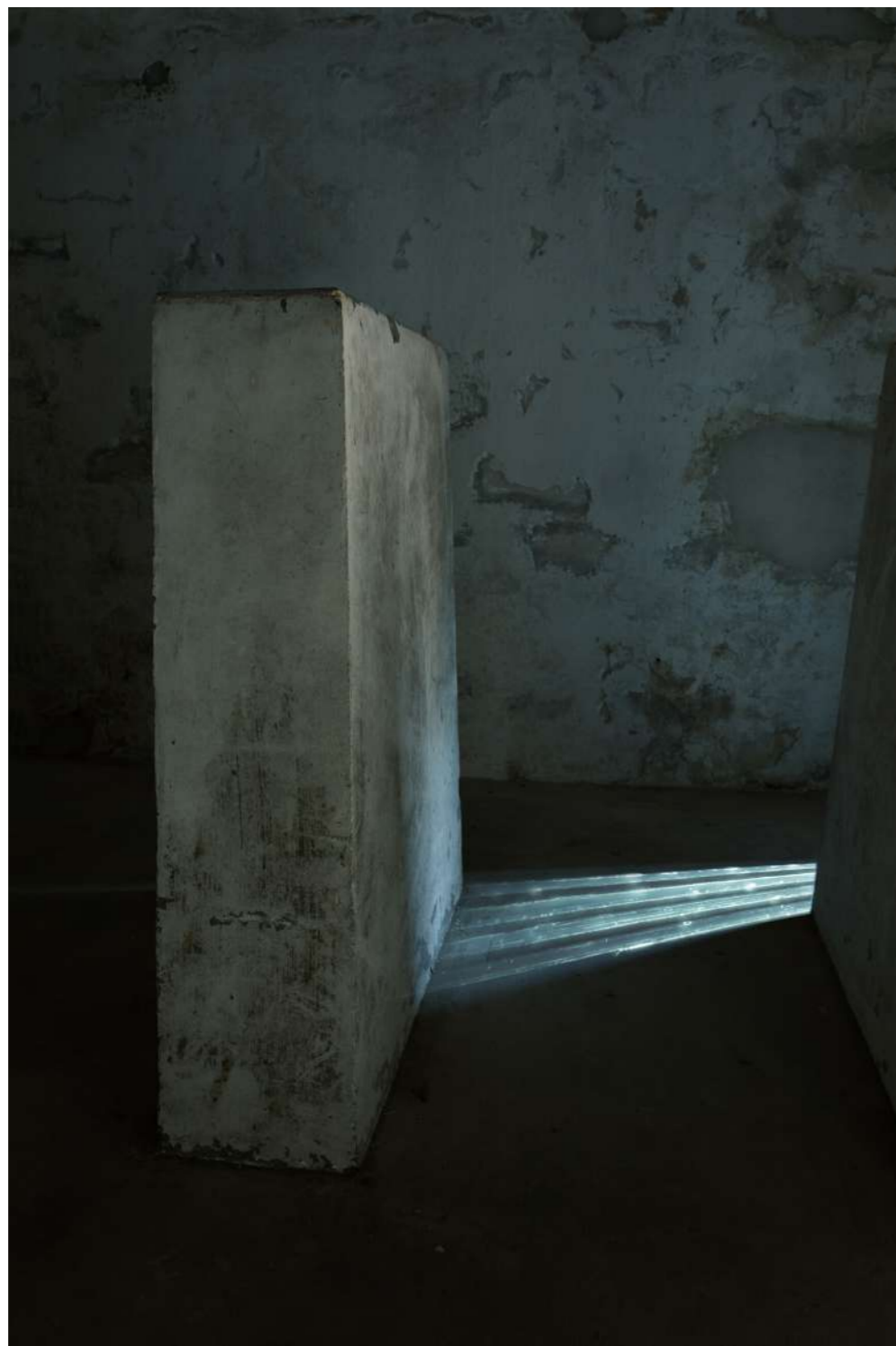
Corinne Mercadier, Une borne à l'infini, La nuit magnétique series, 2022-24 painting on glass and photographs print on platinum fiber rag Canson paper black wood frame with anti-reflective glass edition of 5 (+2AP) – 60 x 40 cm