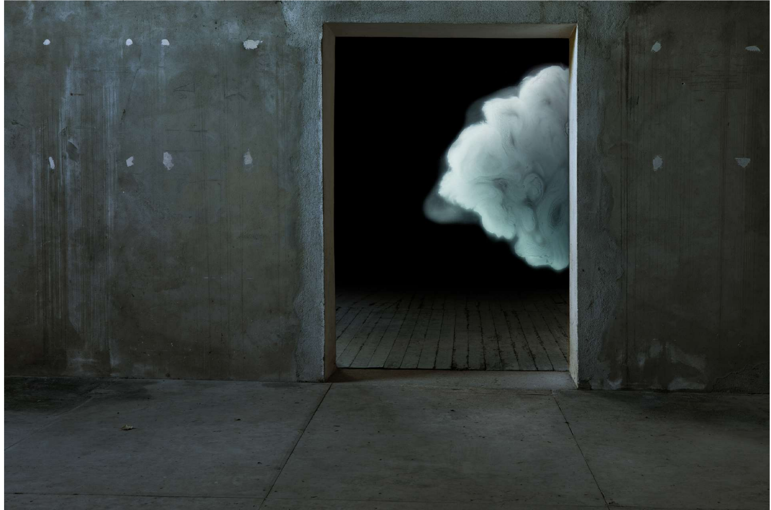
Corinne Mercadier, Le voir passer , La nuit magnétique series, 2022-24 painting on glass and photographs, print on platinum fiber rag Canson paper black wood frame with anti-reflective glass, edition of 5 (+2AP) – 60 x 90 cm