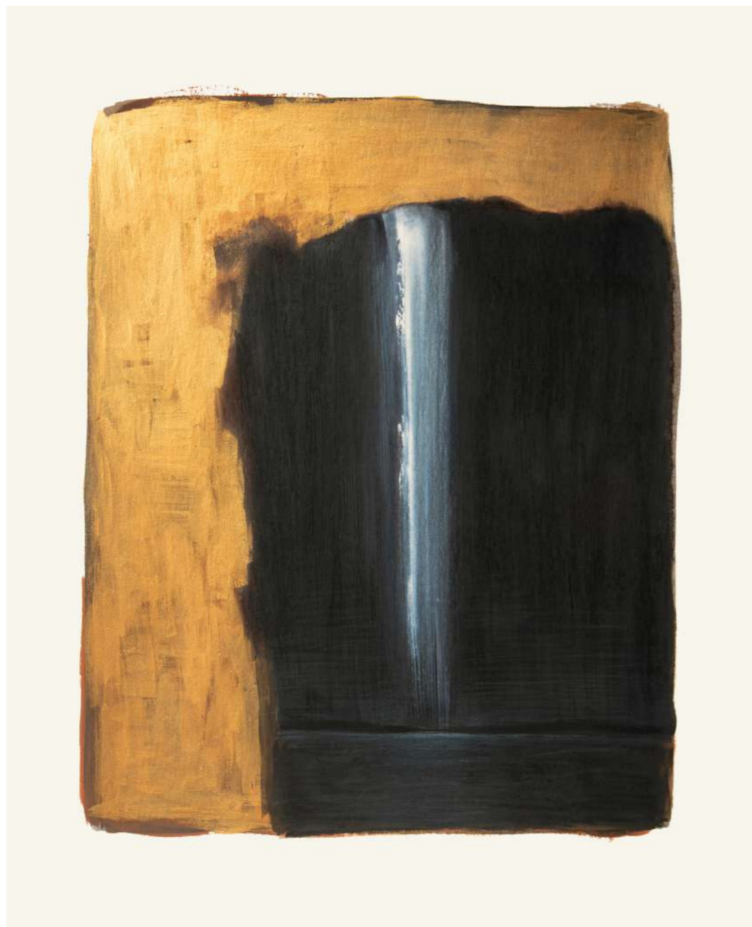
Corinne Mercadier, 20, Rêves series, 2023 ink, gouache, coloured pencil on Lavis Vinci paper frame and anti-reflective glass unique piece - 42.5 x 36 cm