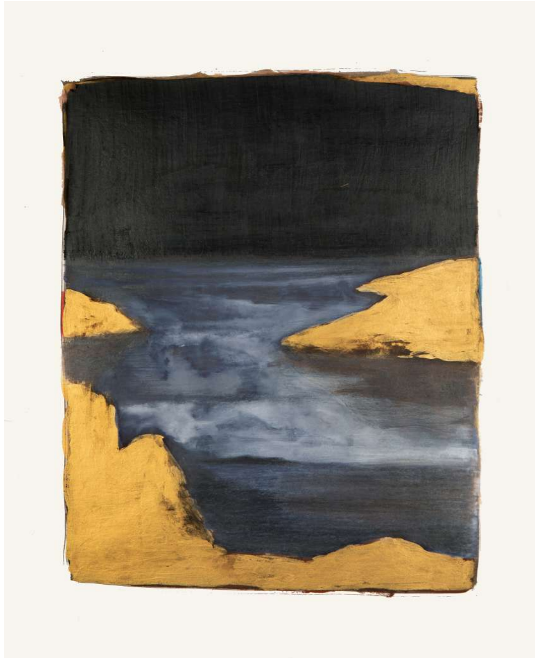
Corinne Mercadier, 39, Rêves series, 2023 ink, gouache, coloured pencil on Lavis Vinci paper frame and anti-reflective glass unique piece - 42.5 x 36 cm