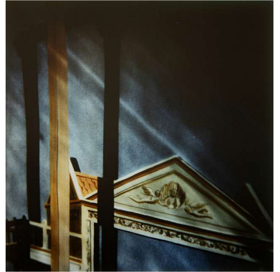
Corinne Mercadier, Triptyque bleu, Polaroids-Photographies series, 1985-86 paintings on glass, polaroid SX70 rephotographed on Ekta 4/5 inch Cibachrome film framed with anti-reflective glass triptych, unique piece - 34 x 76 cm