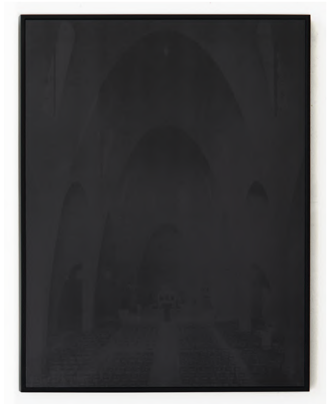
Laurence Aëgerter, Sainte-Jeanne-d'Arc de Nice Cathédrales hermétiques series, 2016 ultrachrome silk-screen printing with thermo-sensitive ink laminated on Dibond, black wood frame edition 5/6 (+2AP) - 85 x 65 cm