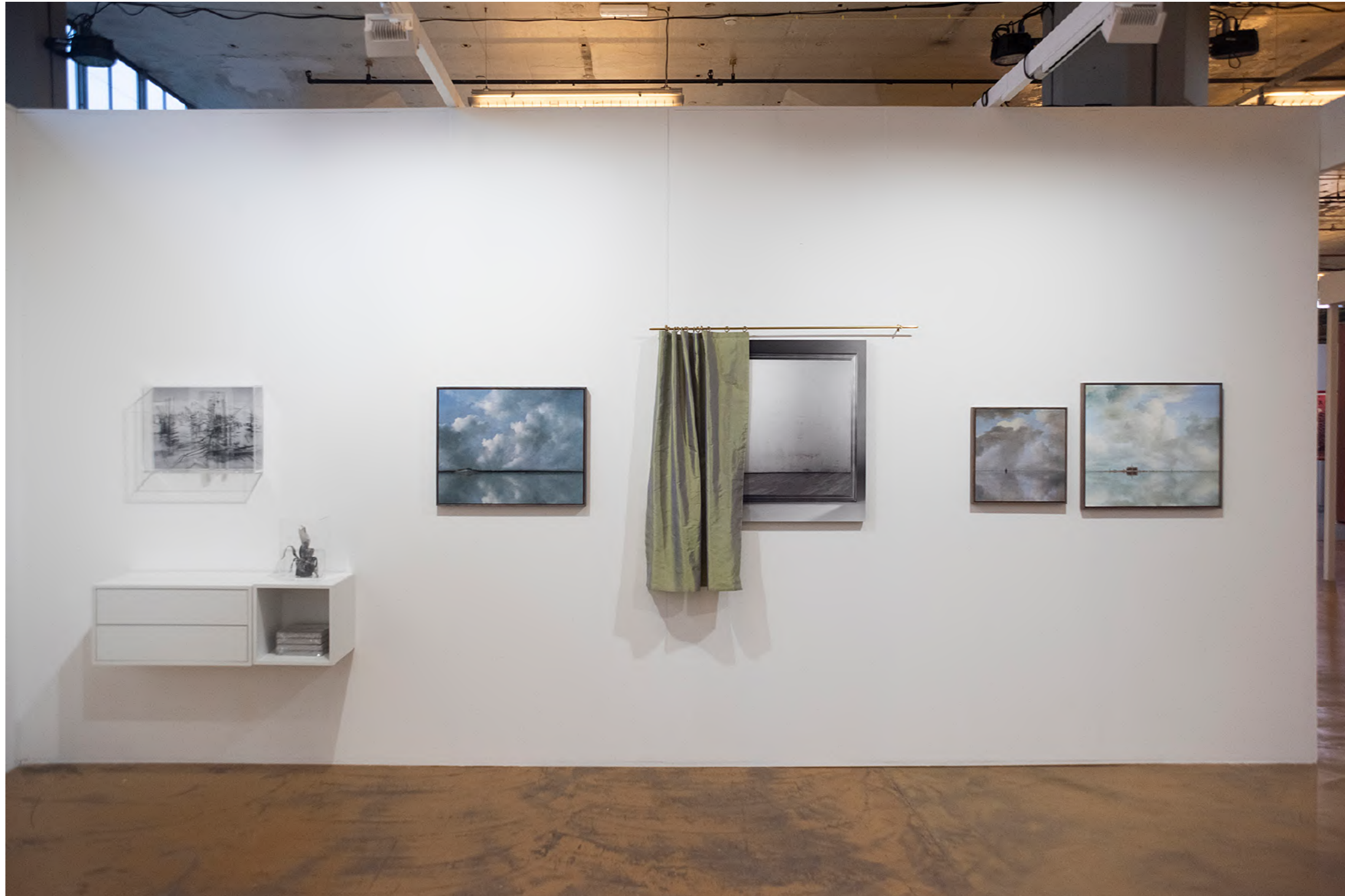
Laurence Aëgerter, Le miroir aveugle , 2023 booth view, Art Rotterdam, 2024