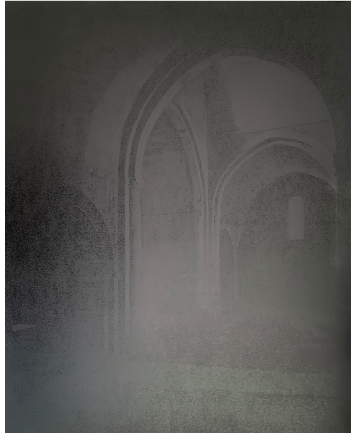
Laurence Aëgerter, Le Thoronet (transept), Cathédrales hermétiques series, 2023 ultrachrome silk-screen printing with thermo-sensitive ink laminated on Dibond, black wood frame edition of 6 (+2AP) - 85 x 65 cm

CATHÉDRALES HERMÉTIQUES - LE THORONET (CLOISTER)