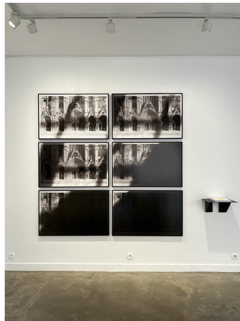
Laurence Aëgerter, Cathédrales series, 2014 exhibition view « Éloge du double » ( In praise of the double ) Galerie Binome, Paris, 2022