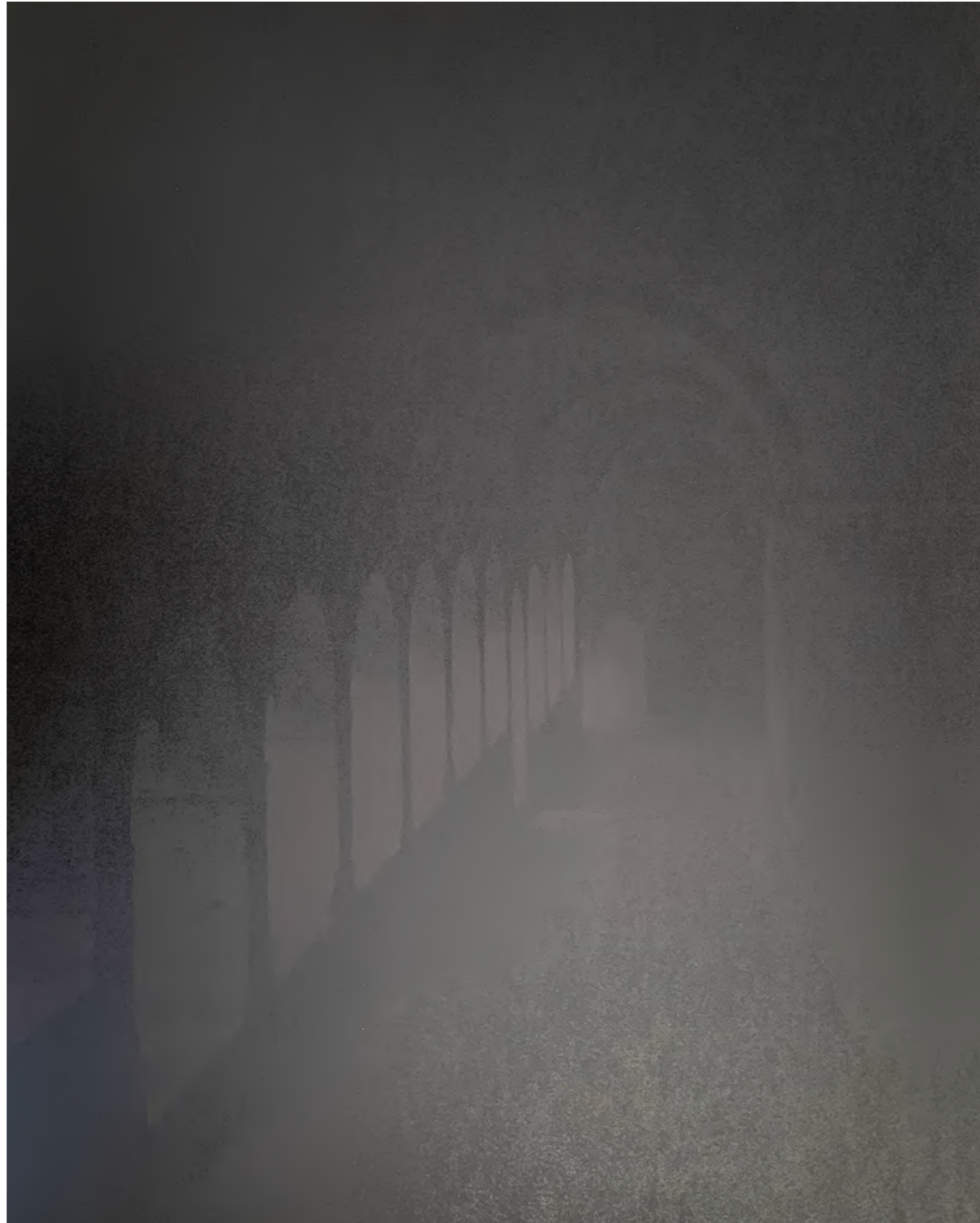
Laurence Aëgerter, Le Thoronet (cloister), Cathédrales hermétiques series, 2023 ultrachrome silk-screen printing with thermo-sensitive ink laminated on Dibond, black wood frame edition of 6 (+2AP) - 85 x 65 cm

CATHÉDRALES HERMÉTIQUES - LE THORONET (CLOISTER)