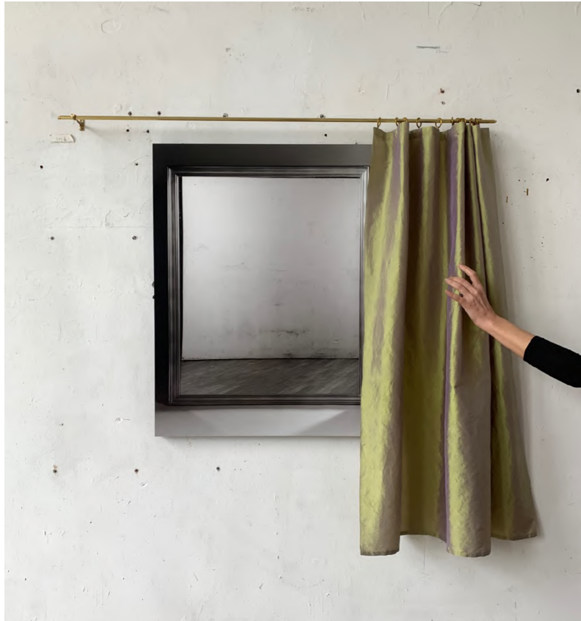
Laurence Aëgerter, Le miroir aveugle , 2023 archival pigment print on FineArt Baryta paper laminated on Dibond, aluminium chassis silk taffeta curtain, brass rod edition 3/6 (+2AP) - installation 117 x 122 cm - photography 82,5 x 65 cm