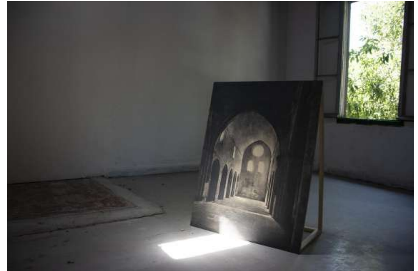
Laurence Aëgerter, Sénanque (revealed) , Cathédrales hermétiques series, 2019 exhibition view « Cathédrales Hermétiques », Rencontres d'Arles 2019