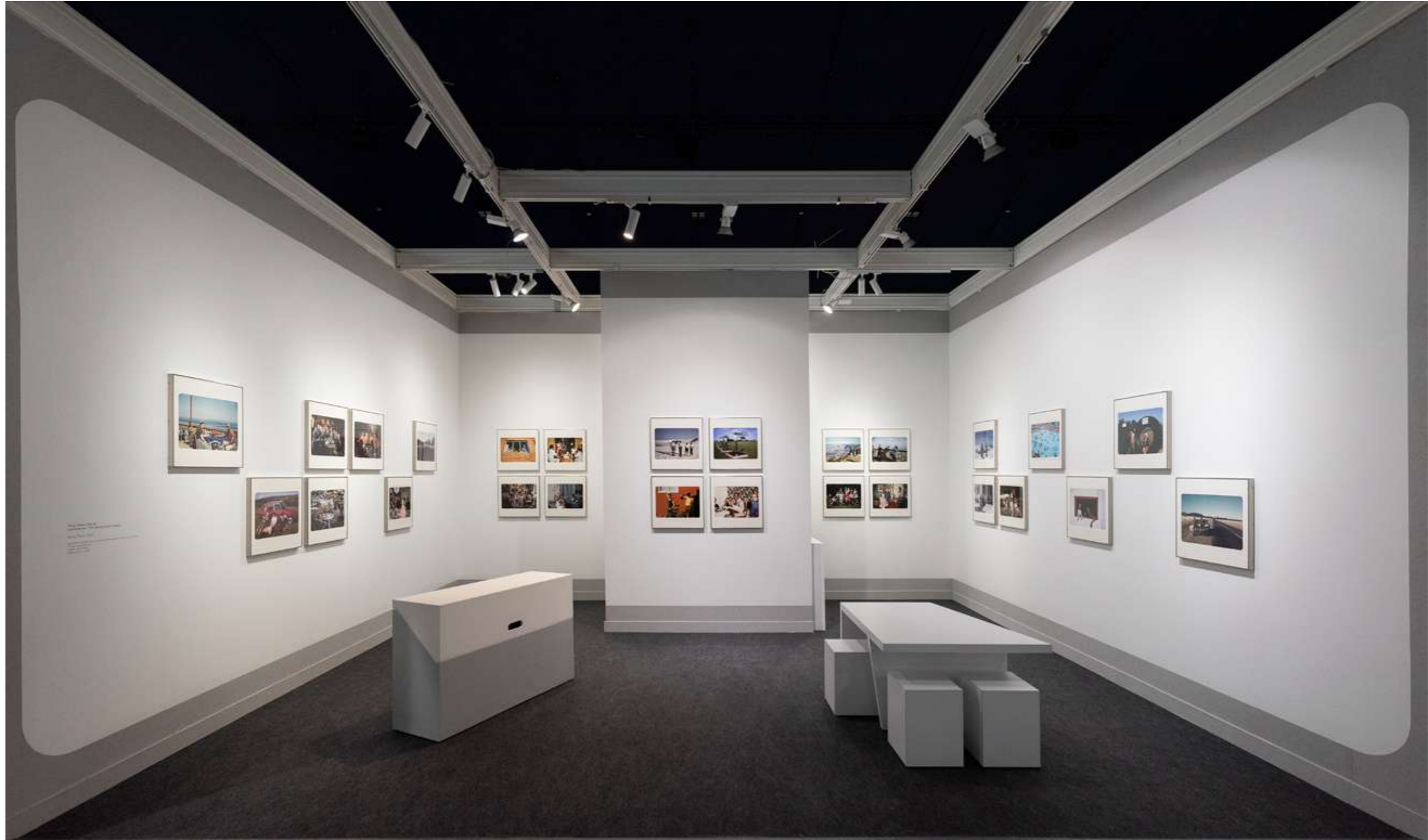
Booth View - Paris Photo 2023