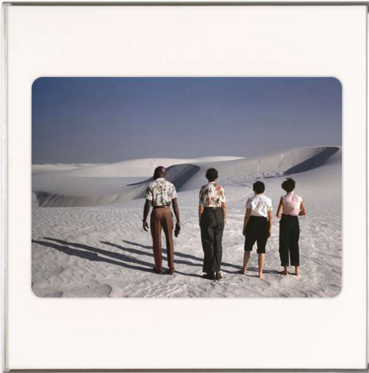
Omar Victor Diop & Lee Shulman / The Anonymous Project Being There 11, 2023 Pigment inkjet print on Hahnemühle FineArt Baryta Satin paper edition of 5 (+2AP) - 30 x 42,5 cm, frame 50 x 50 cm