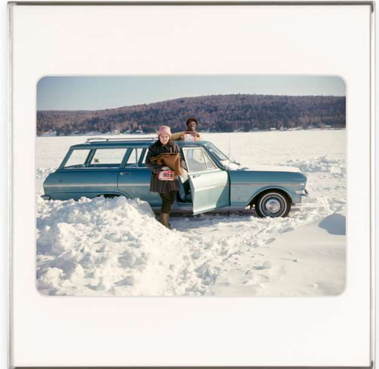
Omar Victor Diop & Lee Shulman / The Anonymous Project Being There 20, 2023 Pigment inkjet print on Hahnemühle FineArt Baryta Satin paper edition of 5 (+2AP) - 30 x 42,5 cm, frame 50 x 50 cm