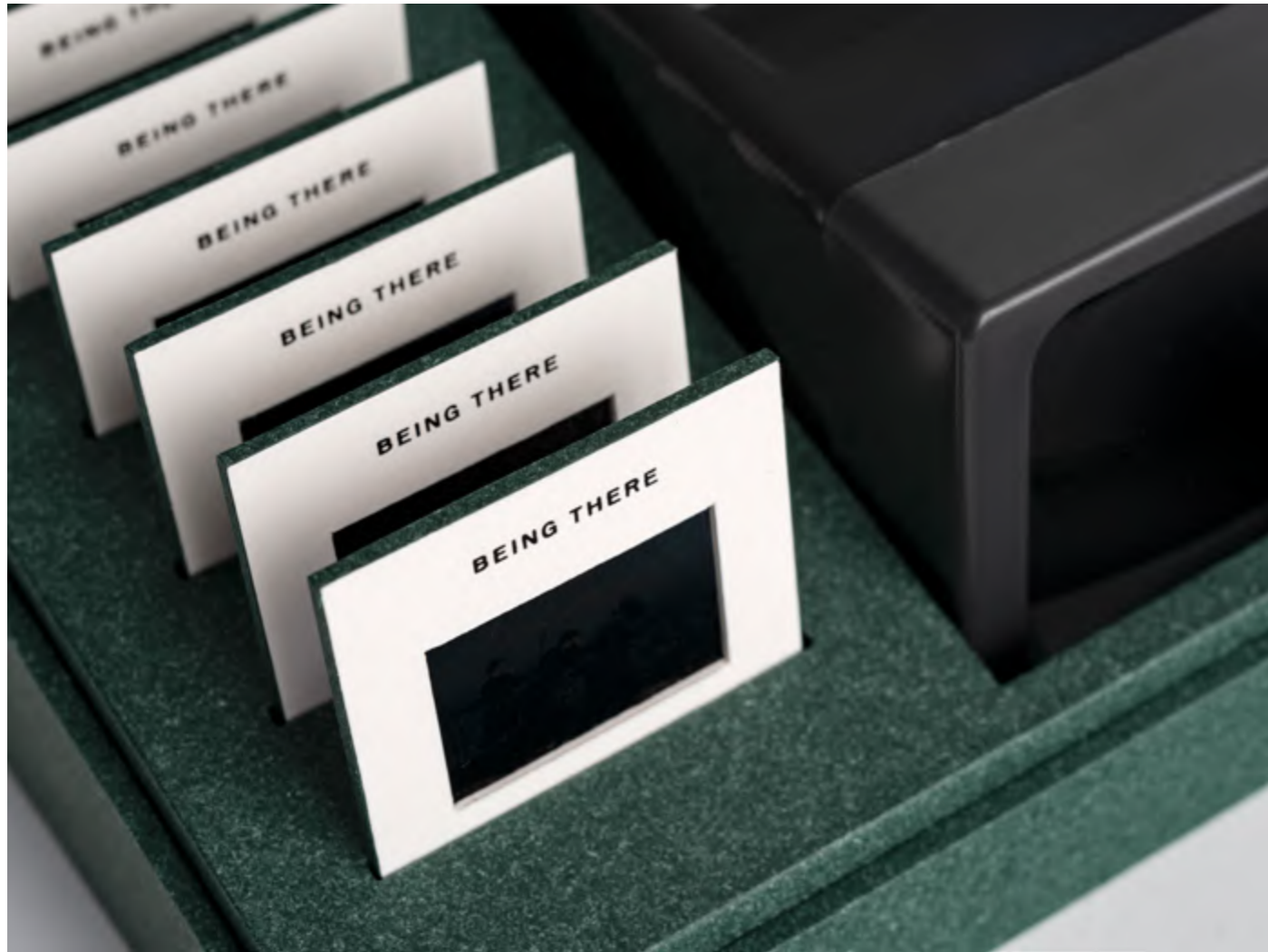
Omar Victor Diop & Lee Shulman / The Anonymous Project Being There - The Green Box, 2023 box of 12 slides and manual viewer box 14,3 x 24,5 x 8 cm - 12 slides 5 x 5 x 0,25 cm - manual viewer 12 x 8 x 7 cm edition of 15 (+2AP)