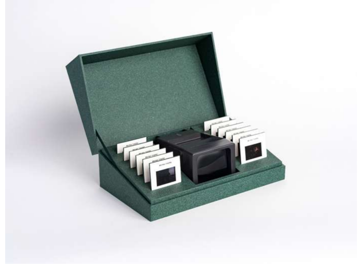
Omar Victor Diop & Lee Shulman / The Anonymous Project Being There - The Green Box, 2023 box of 12 slides and manual viewer box 14,3 x 24,5 x 8 cm - 12 slides 5 x 5 x 0,25 cm - manual viewer 12 x 8 x 7 cm edition of 15 (+2AP)