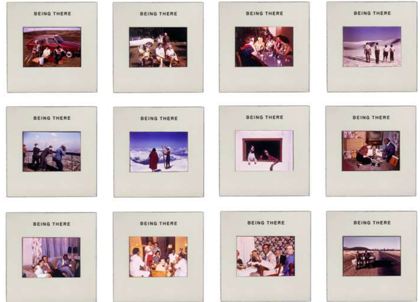
Omar Victor Diop & Lee Shulman / The Anonymous Project Being There - The Green Box, 2023 box of 12 slides and manual viewer box 14,3 x 24,5 x 8 cm - 12 slides 5 x 5 x 0,25 cm - manual viewer 12 x 8 x 7 cm edition of 15 (+2AP)