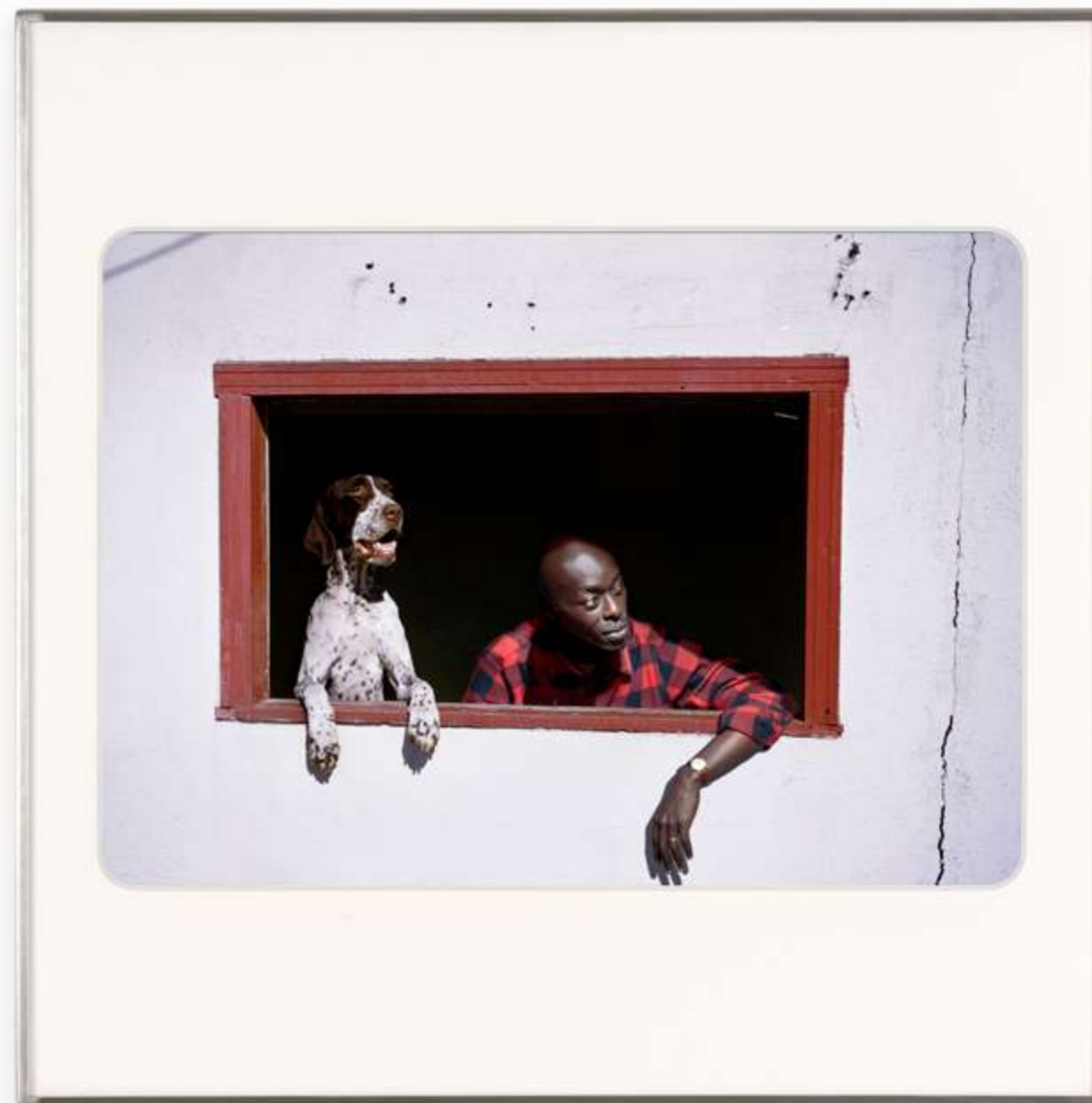
Omar Victor Diop & Lee Shulman / The Anonymous Project Being There 25, 2023 Pigment inkjet print on Hahnemühle FineArt Baryta Satin paper edition of 5 (+2AP) - 30 x 42,5 cm, frame 50 x 50 cm