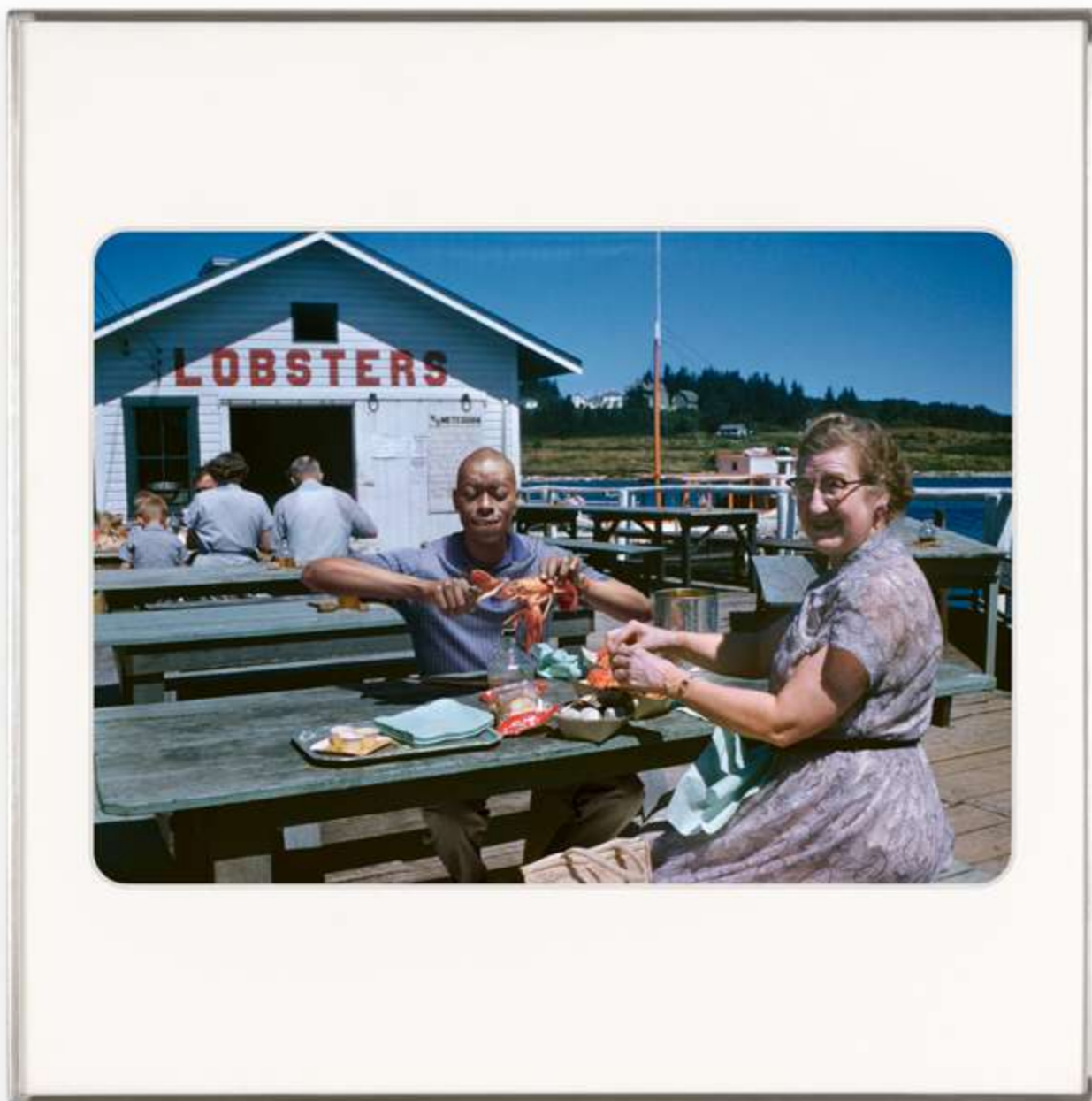
Omar Victor Diop & Lee Shulman / The Anonymous Project Being There 3, 2023 Pigment inkjet print on Hahnemühle FineArt Baryta Satin paper edition of 5 (+2AP) - 30 x 42,5 cm, frame 50 x 50 cm