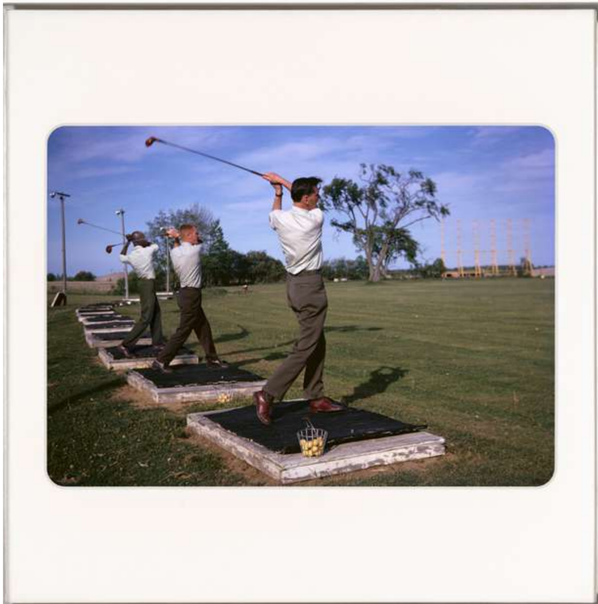
Omar Victor Diop & Lee Shulman / The Anonymous Project Being There 26, 2023 Pigment inkjet print on Hahnemühle FineArt Baryta Satin paper edition of 5 (+2AP) - 30 x 42,5 cm, frame 50 x 50 cm

From the encounter between Lee Shulman / The Anonymous Project and Omar Victor Diop was born Being There series, at the crossroads of the two artists' universes.