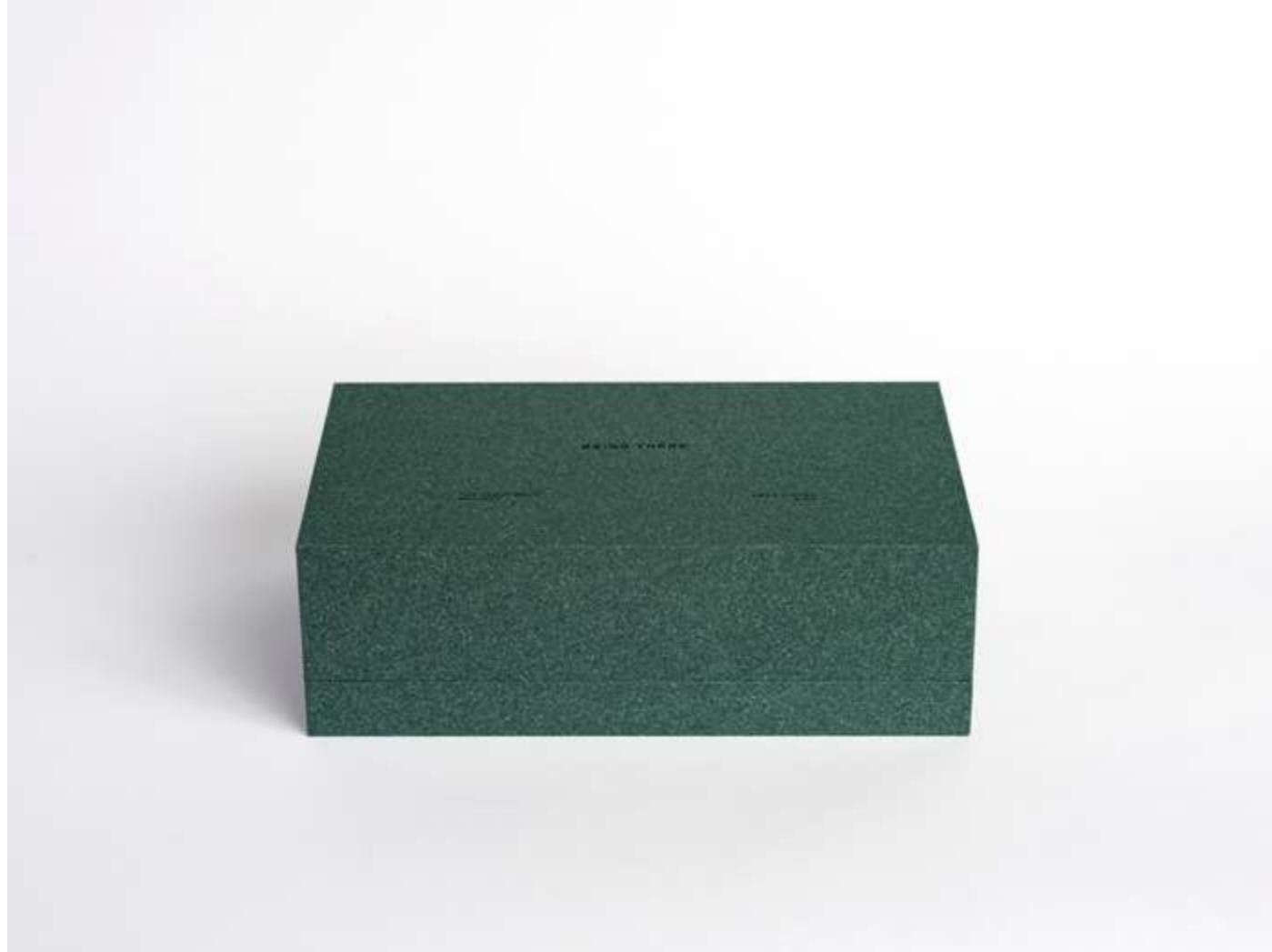
Omar Victor Diop & Lee Shulman / The Anonymous Project Being There - The Green Box, 2023 box of 12 slides and manual viewer box 14,3 x 24,5 x 8 cm - 12 slides 5 x 5 x 0,25 cm - manual viewer 12 x 8 x 7 cm edition of 15 (+2AP)