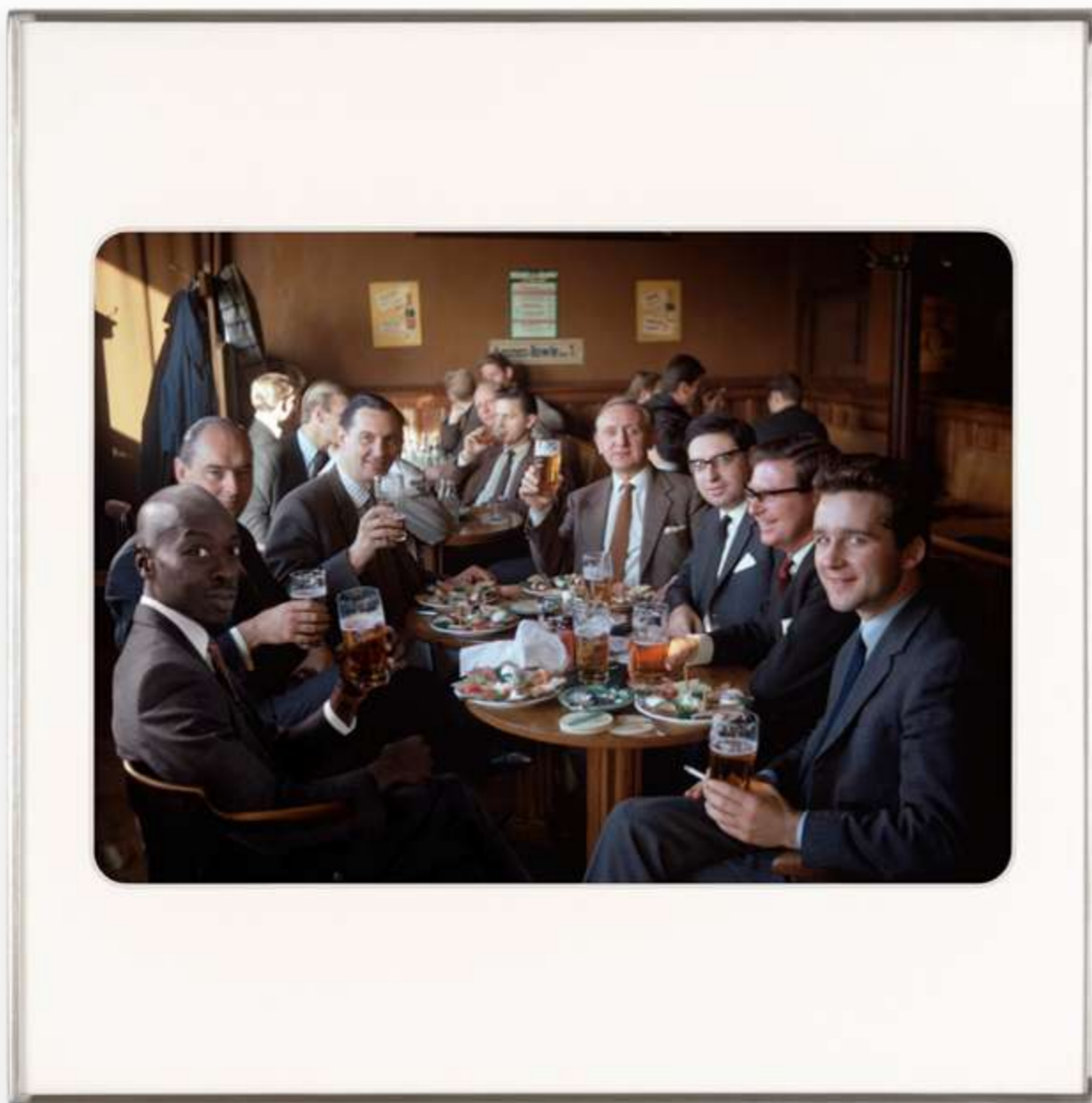
Omar Victor Diop & Lee Shulman / The Anonymous Project Being There 44, 2023 Pigment inkjet print on Hahnemühle FineArt Baryta Satin paper edition of 5 (+2AP) - 30 x 42,5 cm, frame 50 x 50 cm