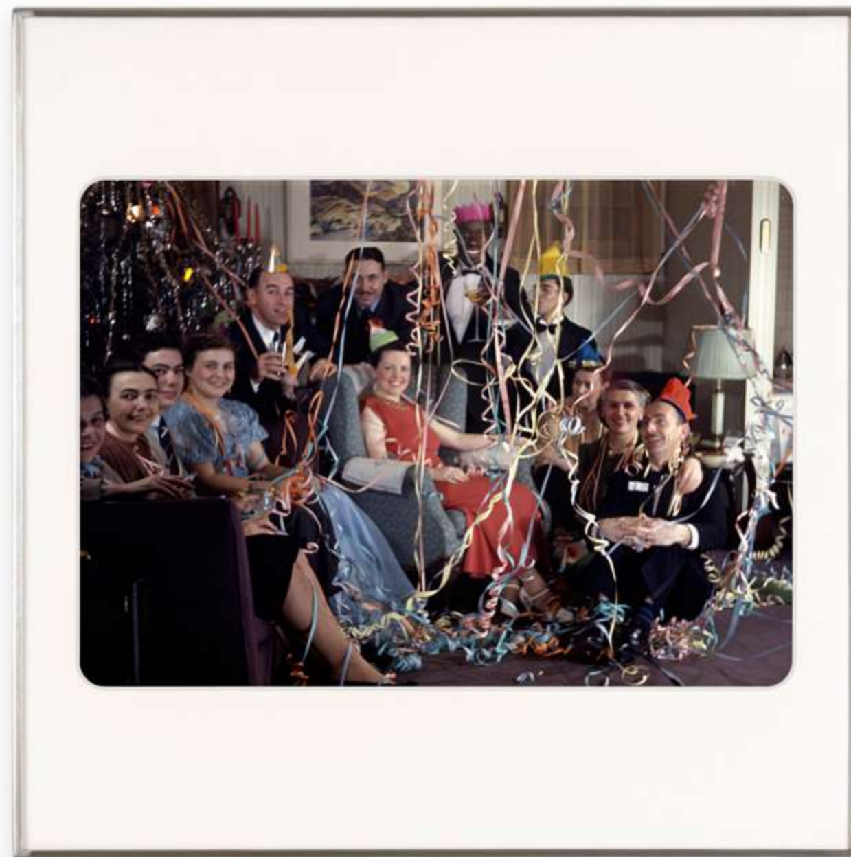
Omar Victor Diop & Lee Shulman / The Anonymous Project Being There 47, 2023 Pigment inkjet print on Hahnemühle FineArt Baryta Satin paper edition of 5 (+2AP) - 30 x 42,5 cm, frame 50 x 50 cm