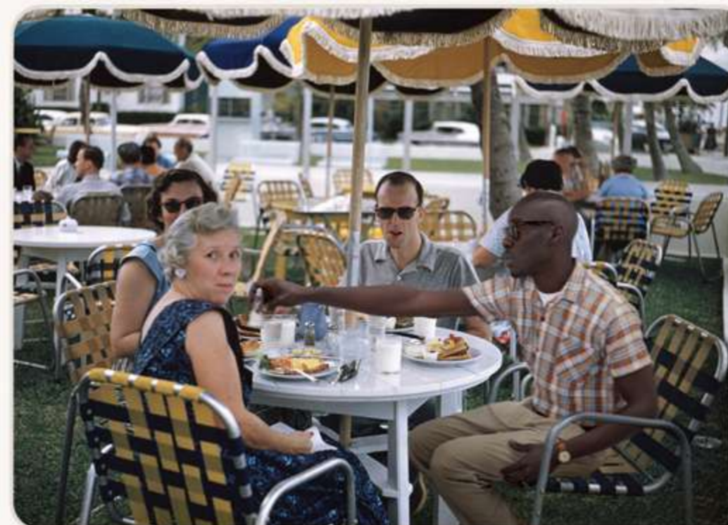
Omar Victor Diop & Lee Shulman / The Anonymous Project Being There 7, 2023 Pigment inkjet print on Hahnemühle FineArt Baryta Satin paper edition of 5 (+2AP) - 30 x 42,5 cm, frame 50 x 50 cm

Conversation : Omar Victor Diop – Lee Shulman Being There, Textuel edition (October 2023 release)