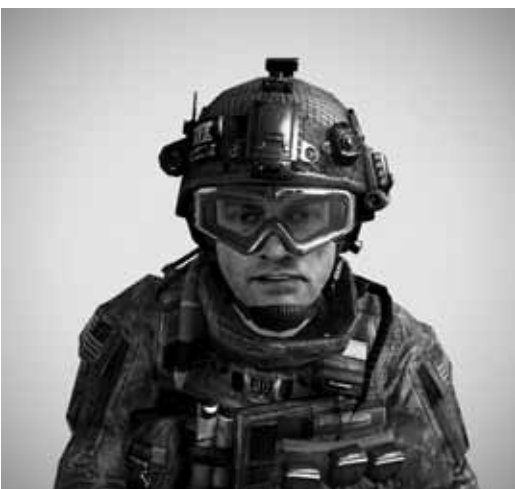
© Thibault Brunet, First person shooter Pvt Casey / 40 x 40 cm courtesy Galerie Binôme