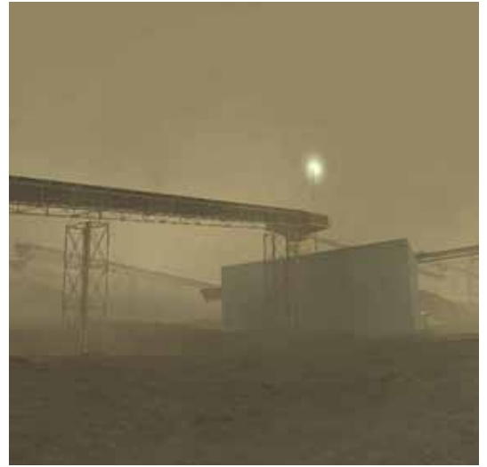
Vice City 2-10-2007 22h40 / 20 x 20 cm