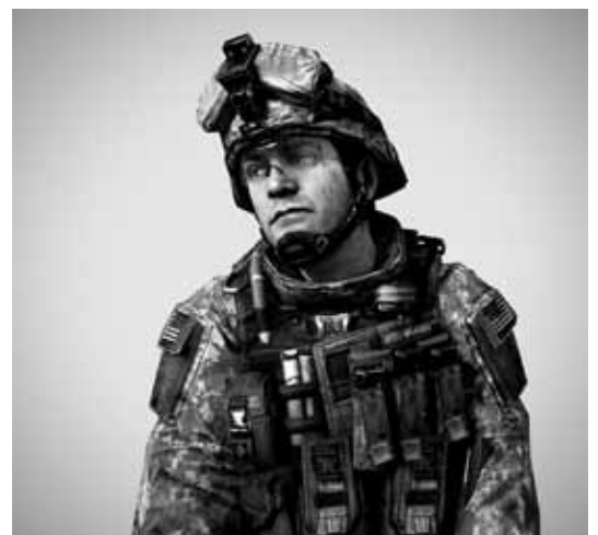
© Thibault Brunet, First person shooter Pvt Golden / 40 x 40 cm courtesy Galerie Binôme